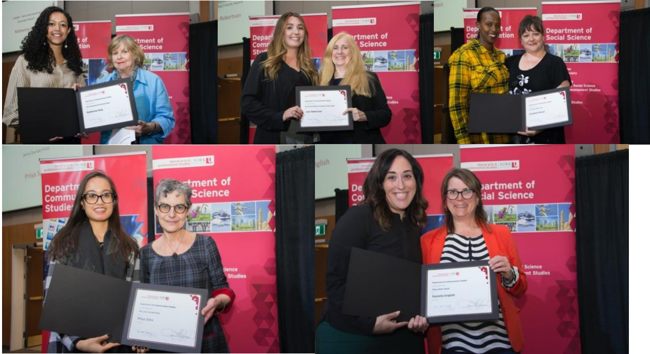
2019 Social Science & Communication Studies Awards Ceremony Award Winners